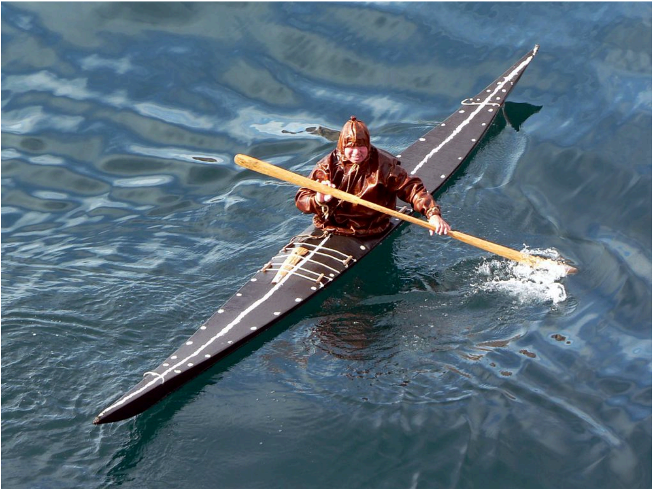
Fig 4.1: Inuit Kayaker