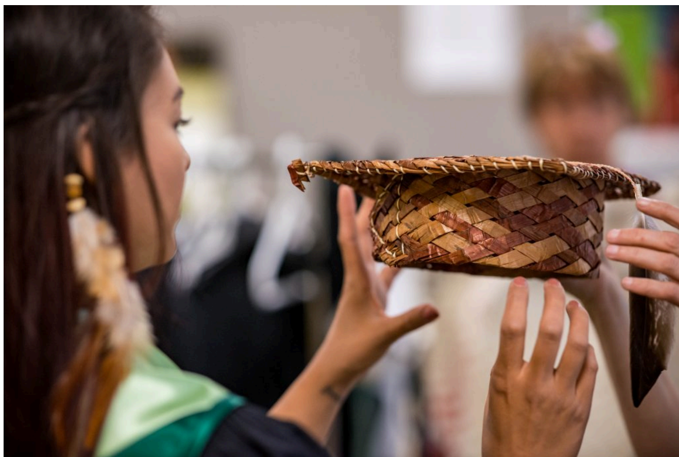
Fig 5.1: UFV Indigenous Graduate Reception 2017