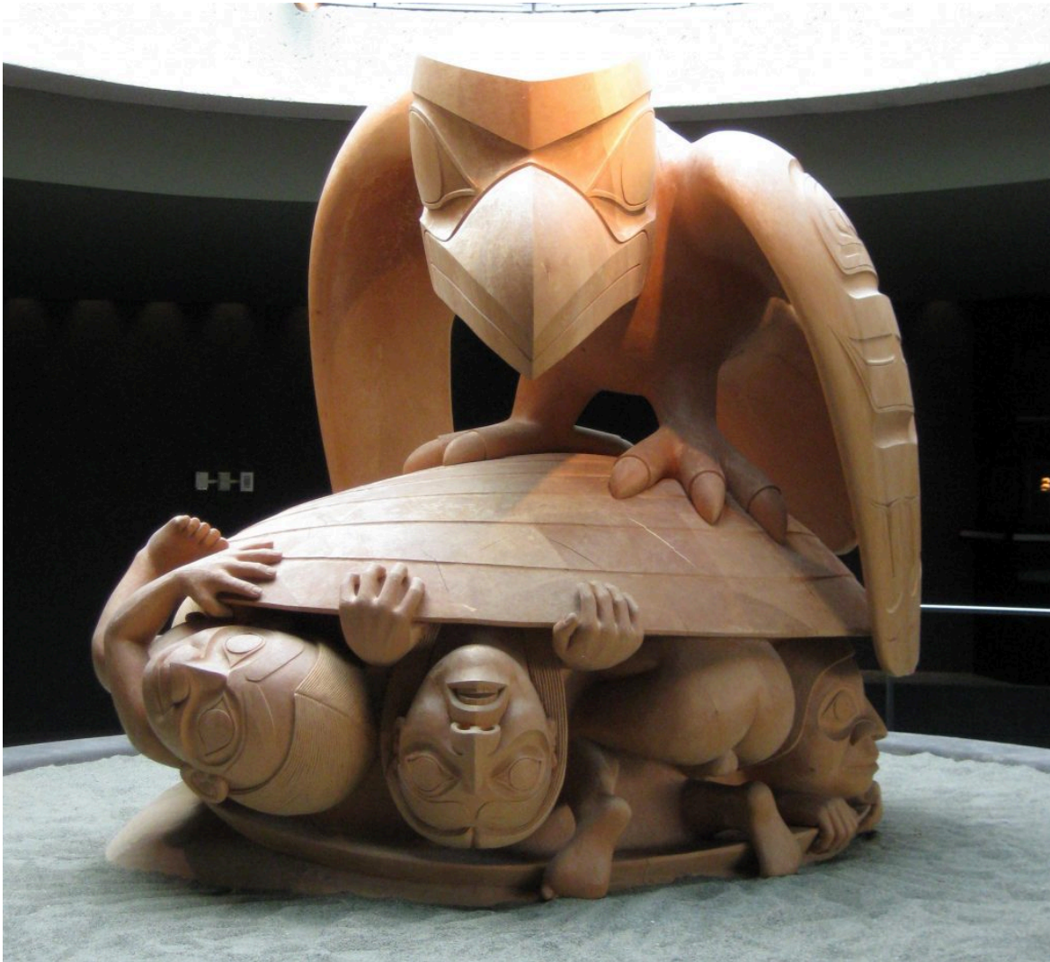
Fig 1.1 “Raven and the First Men” by Bill Reid , Museum of Anthropology, UBC, Vancouver, British Columbia