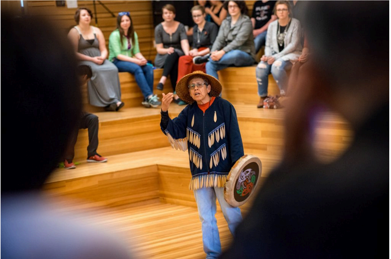
Fig 3.1: Indigenous Graduate Reception