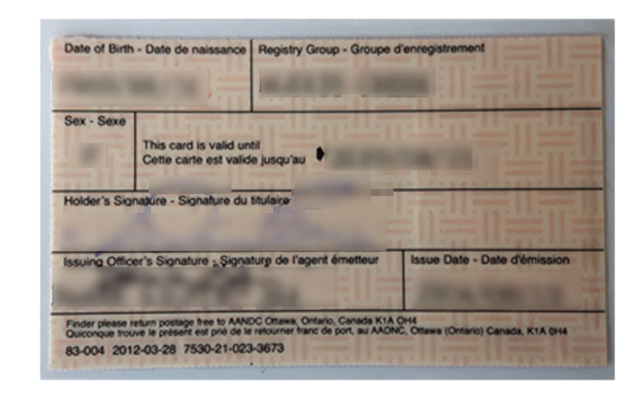
Fig 1.2: Status identity card.