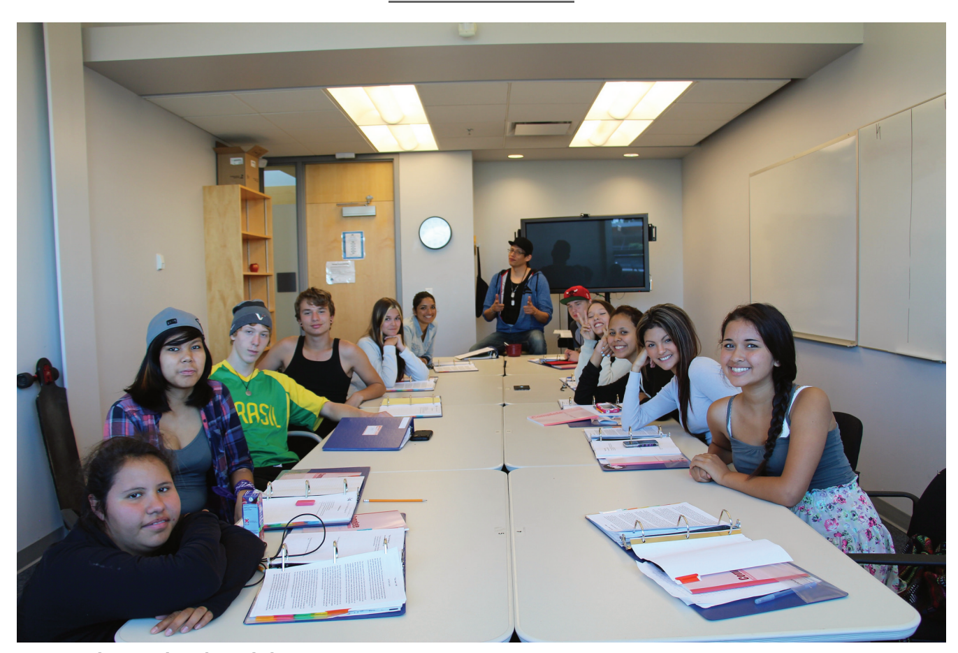
Fig 1.1: Aboriginal math/English camp.