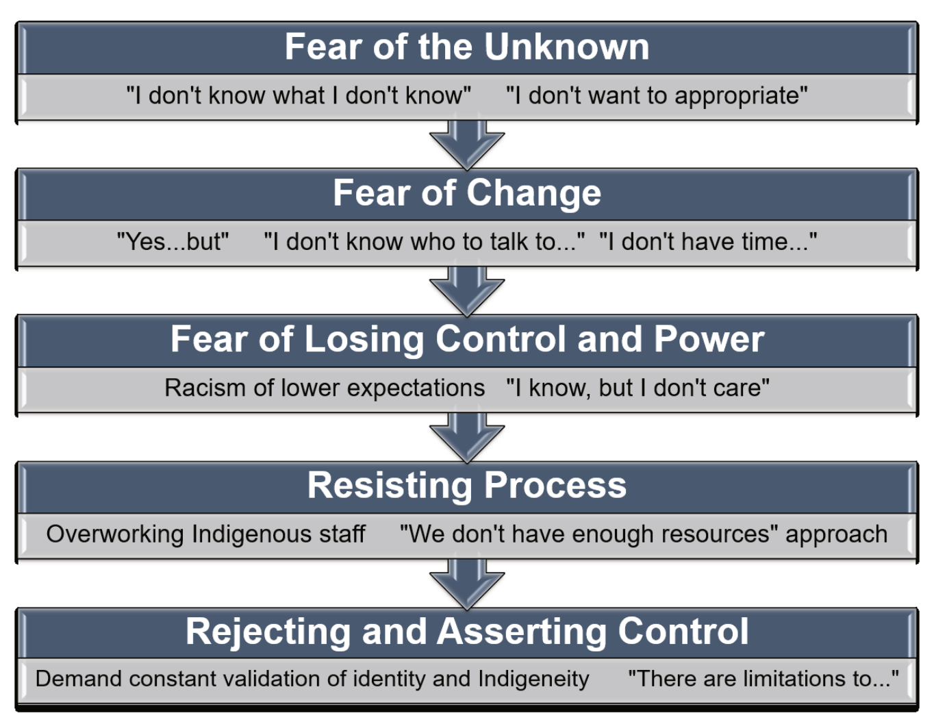
Fig 4.2: Levels of Indigenization. [Long Description]

If you are at a point of Indigenizing your practice, you may still have to face fears and concerns. When developing the framework for the Indigenization project, the project steering committee considered the statements and instances where systemic change is not supported. The committee members then situated them in "levels of Indigenization." These levels progress from fears to control and then rejection of Indigenization processes. They are not progressive levels, but they show that there are various levels of resistance and barriers to Indigenizing practice, field of study, and institutions.