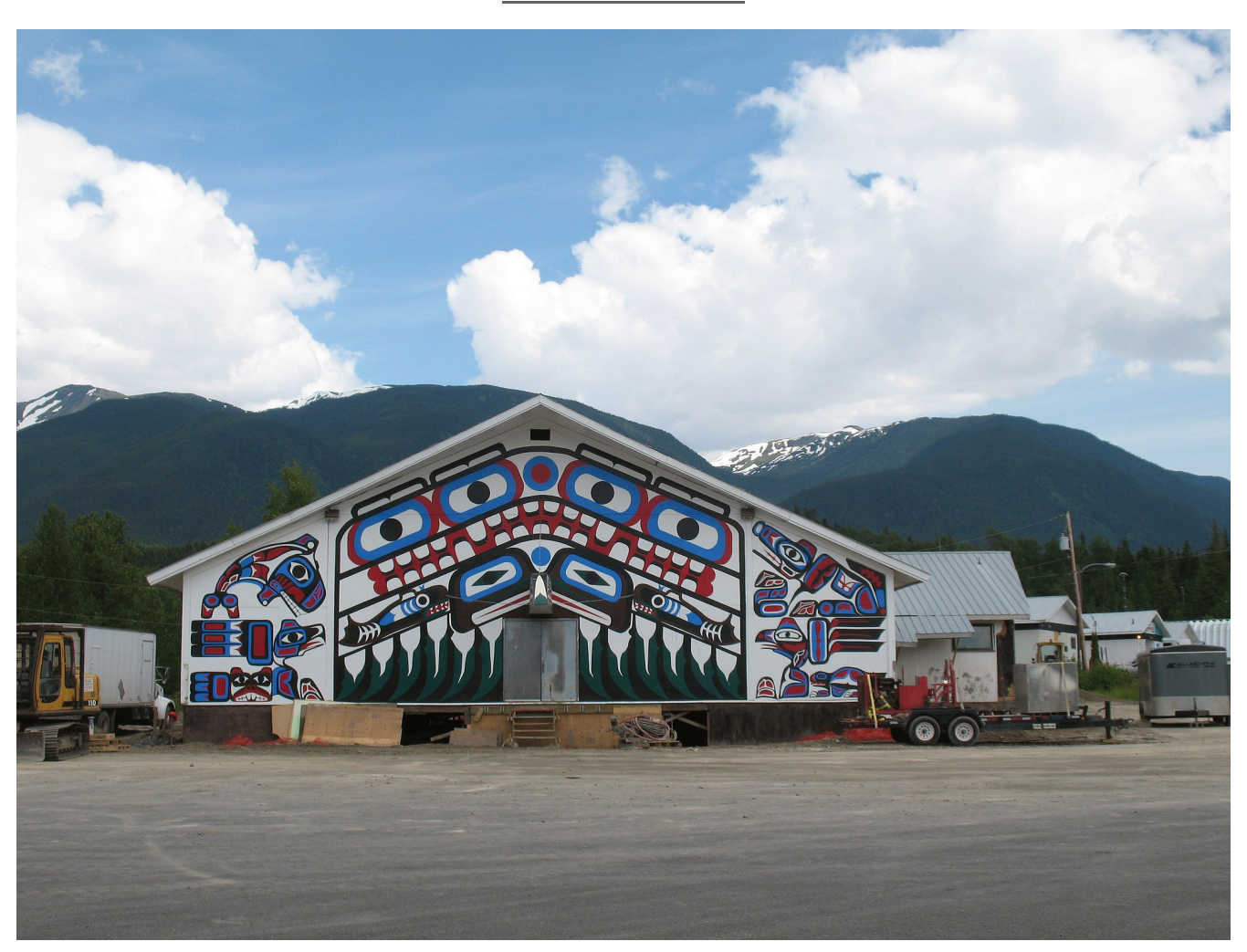
Fig 4.1: Traditional Nisga'a house in New Ayanish.