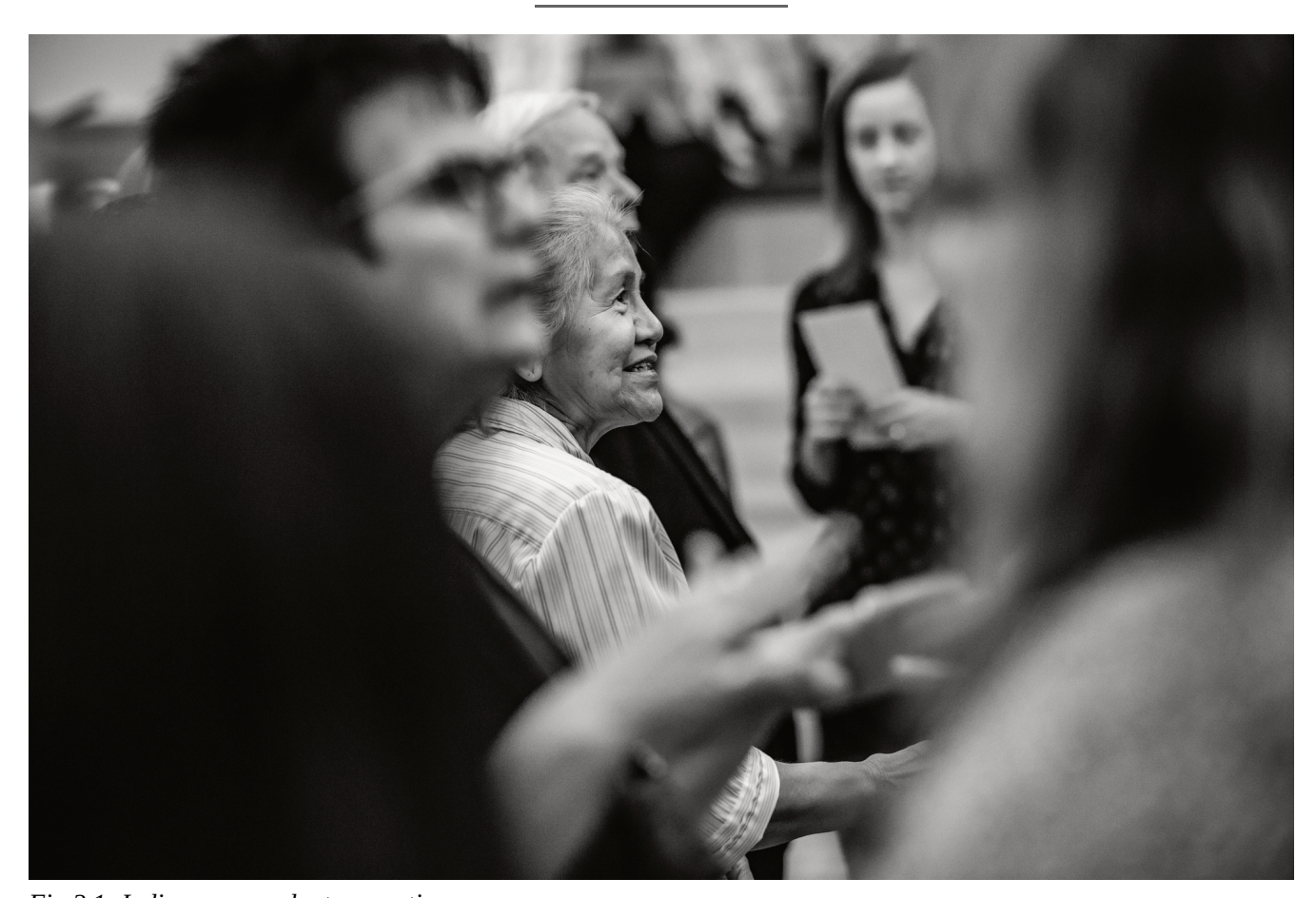
Fig 2.1: Indigenous graduate reception.