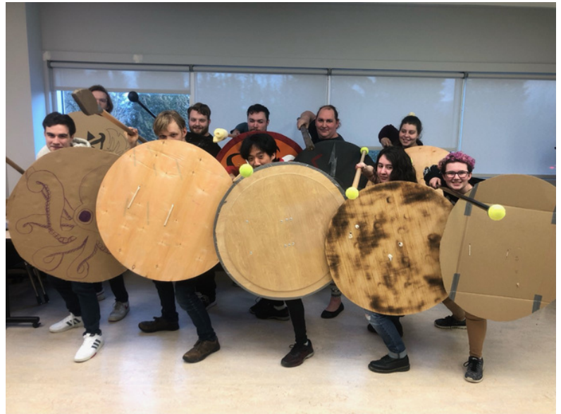
Recent scenes from two of the many fascinating history courses you can take at UFV. History 313 (above) and History 309 (below).