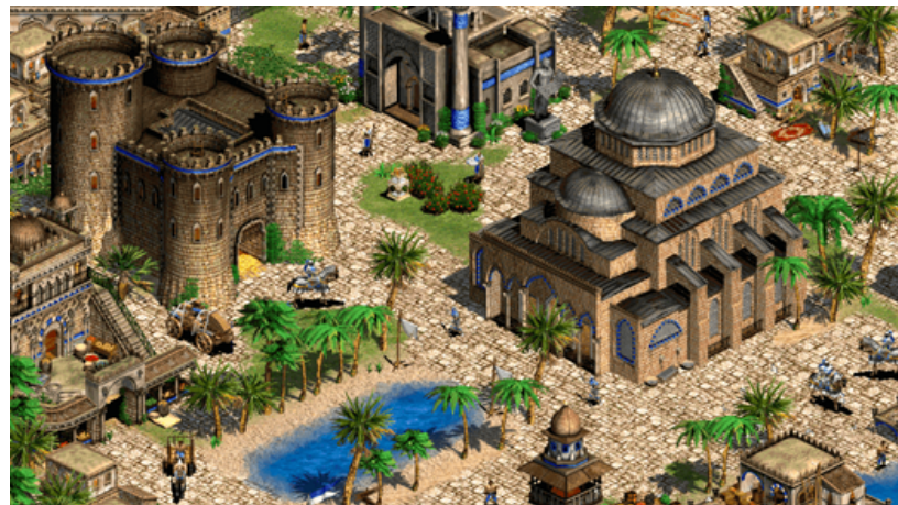
Age of Empires II gameplay