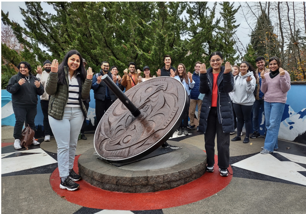
BUS 444 Students expressing their thanks to Seabird Island Band and Nations Creations

The School of Business and the Accounting and Finance area look forward to building on this new initiative