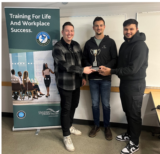
Monday Class of BUS 322

This year, students generated more than $8,500 in membership sales for the Abbotsford Chamber of Commerce!