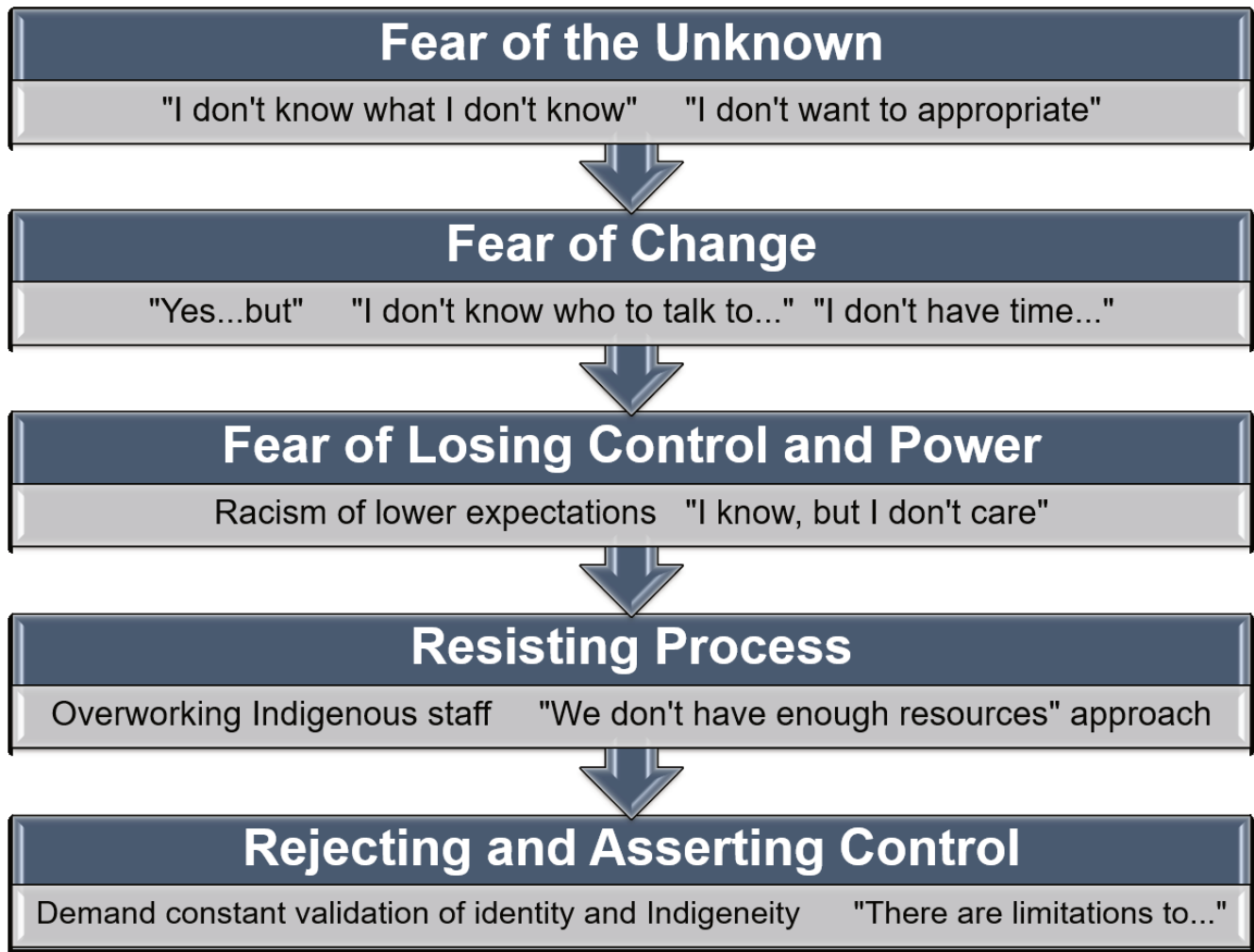
Fig 4.2: Levels of Indigenization. [Long Description]

If you are at a point of Indigenizing your practice, you may still have to face fears and concerns. When developing the framework for the Indigenization project, the project steering committee considered the statements and instances where systemic change is not supported. The committee members then situated them in “levels of Indigenization.” These levels progress from fears to control and then rejection of Indigenization processes. They are not progressive levels, but they show that there are various levels of resistance and barriers to Indigenizing practice, field of study, and institutions.