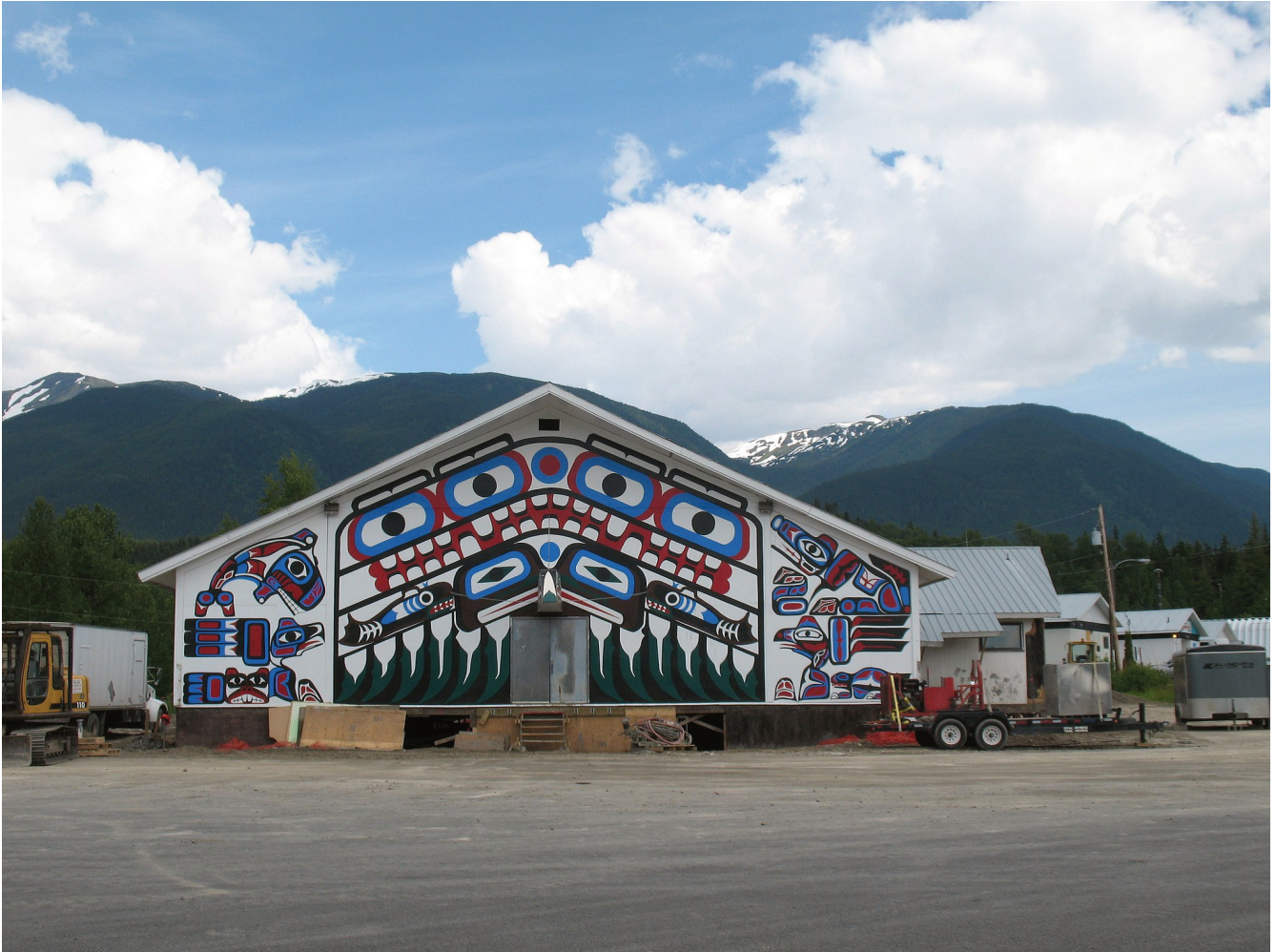
Fig 4.1: Traditional Nisga'a house in New Ayanish.