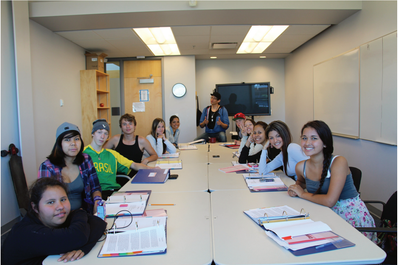
Fig 1.1: Aboriginal math/English camp.