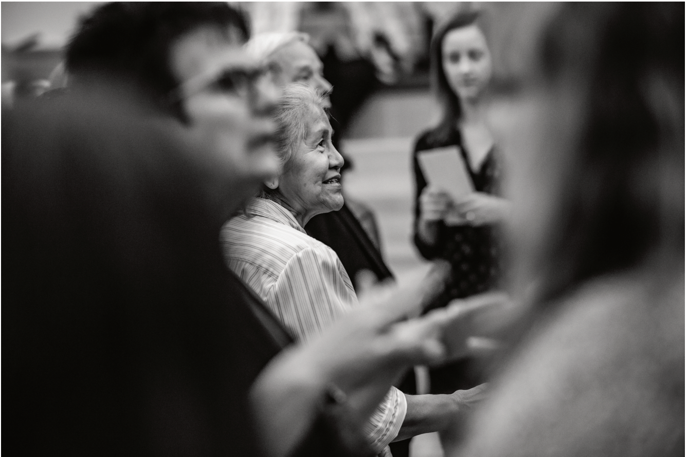
Fig 2.1: Indigenous graduate reception.