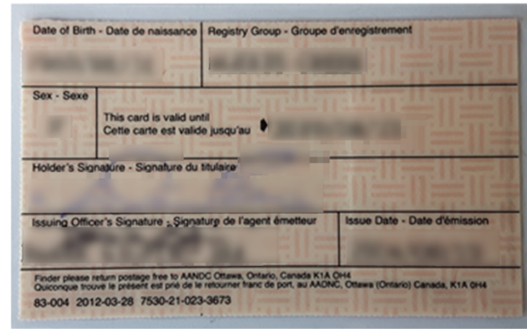
Fig 1.2: Status identity card.