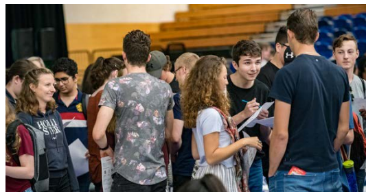
NSO 2019 - Faculty of Science Welcome Session