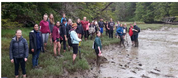
Tofino 2019 mudflats in search of inverts and tsunami signature