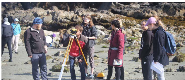
Tofino 2019 McKenzie Beach