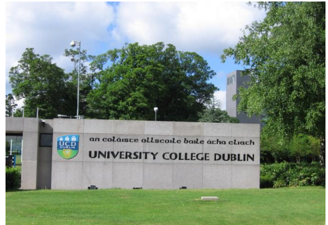
University College Dublin entrance gate

The conference theme focused on new and ongoing challenges for practitioners, researchers and educators of social work on an international basis. The conference theme also reflected on the active role that social work plays in challenging the boundaries of knowledge and skills in health care and practice.