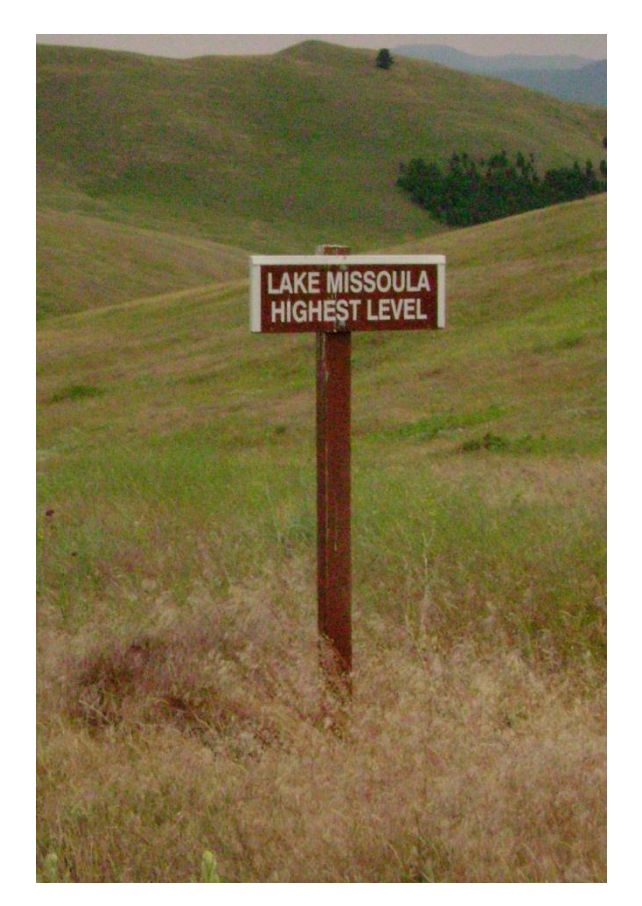
Figure 1: Sign indicating the highest level reached by Glacial Lake Missoula in the Mission Valley, MT.

In this section, we will look at integrating and formatting a variety of figures in a geography assignment. Figures include any kind of visual image such as photographs, maps, screen shots, etc. Figure captions must be included and are placed below the relevant figure. The figure is placed in the text following the first time it is referenced in the text. Figure 1 shows the example of using a photograph taken in the field by a classmate of the author.