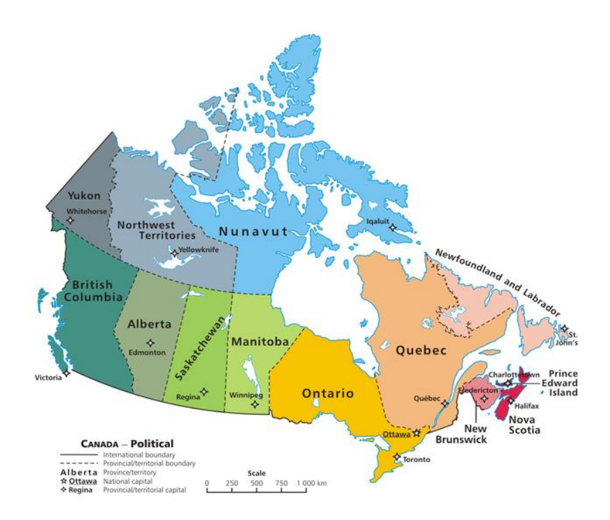
Figure 2. Provincial and territorial political map of Canada (<u>E Pluribus Anthony</u>, 2006 in Wikipedia)

Figures 2, 3 and 4 provide other examples of the types of images that might be used in your geography assignments together with the correct way to reference these images.